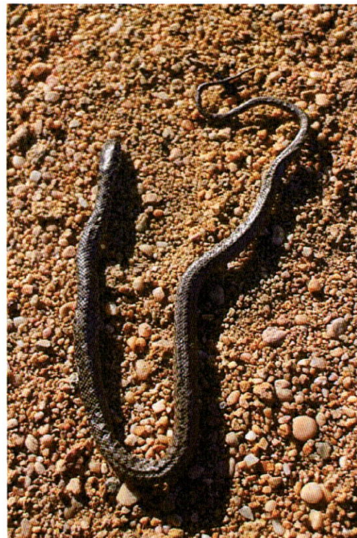
Picture 2: Road killed, freshly hatched specimen, found on the track of bikers.