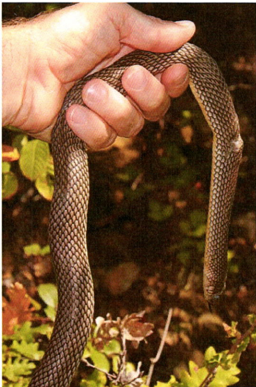
Picture 1: Caspian Whip Snake individual with wounded neck, using a burrow right in the middle of the track of bikers.